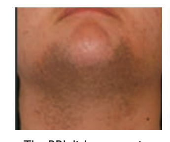
Laser Hair Removal