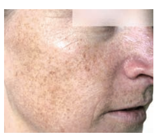
BBL Photofacial/Sun Damage, Brown Spots, Redness